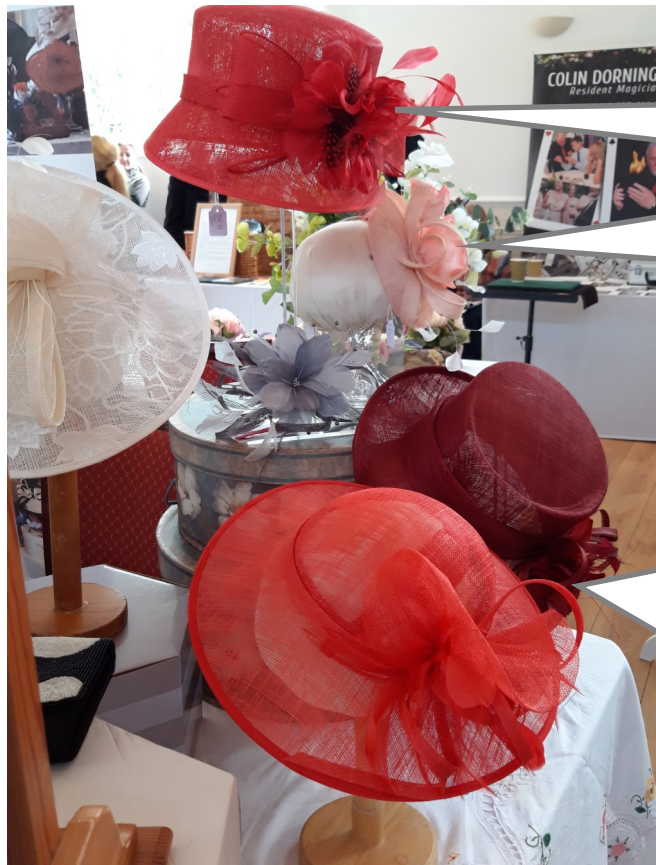
Left: John Lewis neat small brim hat mid-red SKU: 092212