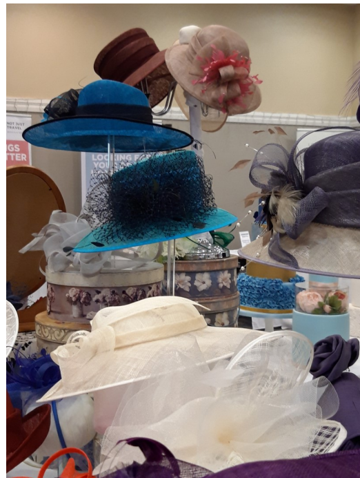
Across left: Debut scarlet medium hatinator SKU: 0619 03

Hi Hat Trix, I have received the hatinator today. It is so beautiful, absolutely perfect match to my mother-of-the-bride outfit. Many thanks for the fast delivery too."